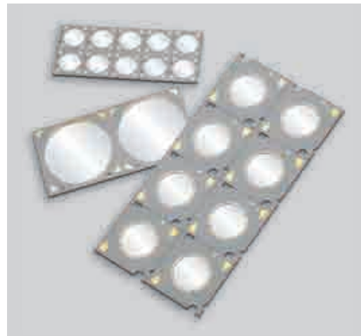
Sample of MC - PCB