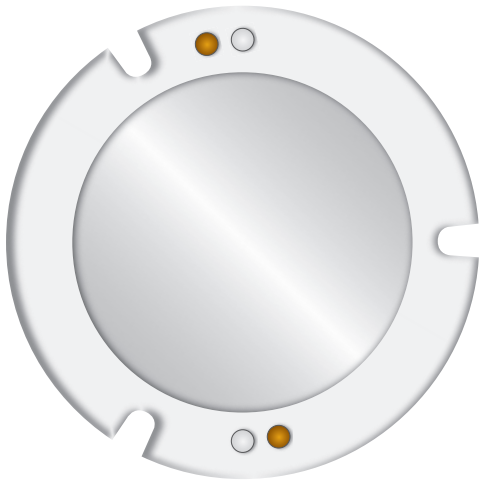
Sample of VLB198 1.00mm

Higher thicknesses and alloys on request